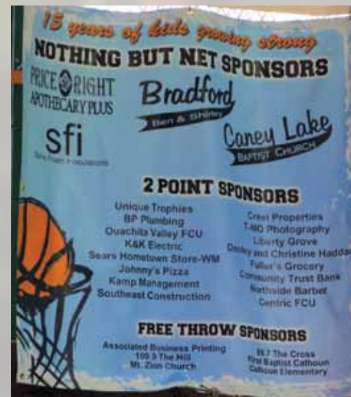
2013 Basketball Sponsors